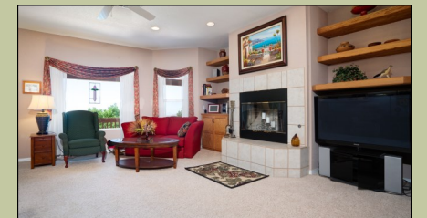
Wynola Estates Offered at $559,000