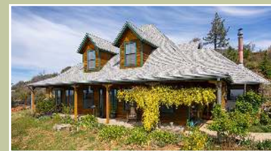
Pine Hills Custom , 2625 SF, 3/4, Views! $659,000