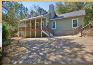
Pine Hills $420,000