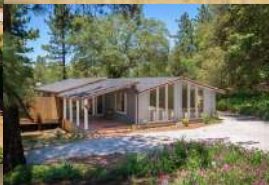
Pine Hills $400K