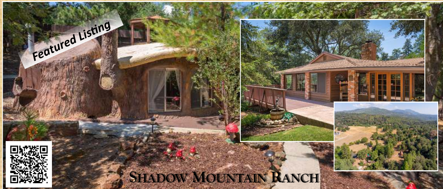
SHADOW MOUNTAIN RANCH

Come In to Pick up a Complimentary Seller's Packet that gives Tips on Selling your Home, Staging, Pricing, Safety and Showings