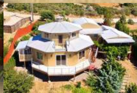
Kentwood II $375K