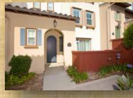
Chula Vista $395K